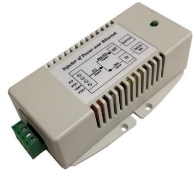
TP-DCDC-1248GD-HP 35W 802.3af/at