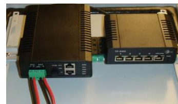
DIN Rail Mounted Controller / Switch