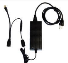
PoE Power Supply/Inserter