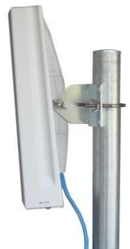
EZ-Bridge®-LT tool-less installation