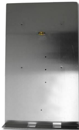
Plenty of space for customer electronics