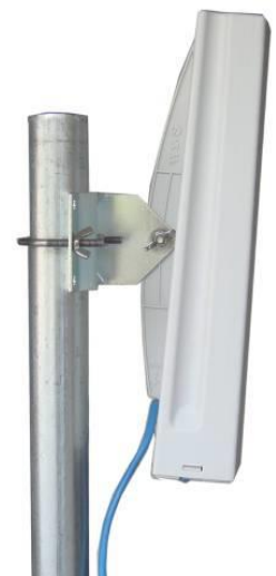
Simple & Functional Design