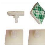
Permanent Adhesive Nylon66 PCB Mounts