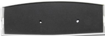
QwikSnap™ cover with RJ45 feed-through