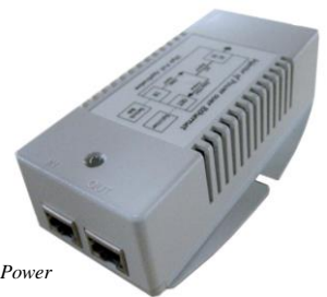
TP-POE-HP High Power