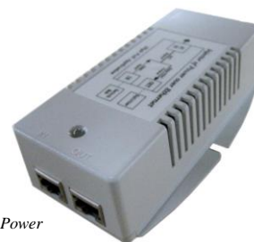
TP-POE-HP High Power