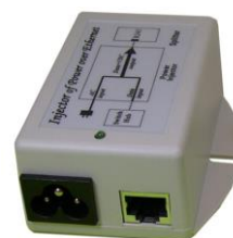
TP-POE Medium Power